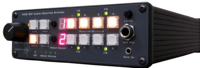
M3G SDI audio monitoring system

Grass Valley, CA: Renegade Labs has released its new M3G SD/HD/3G 8-channel SDI de-embedding audio monitoring system that includes an integrated GUI for control from a PC with initial shipments both domestically and internationally.